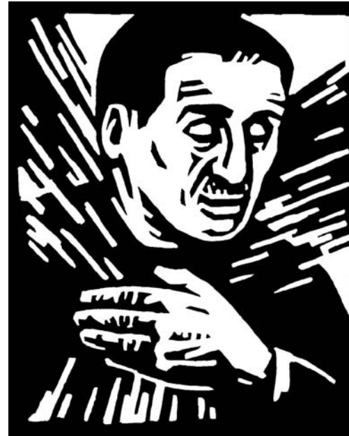
God's love has been poured into our hearts by the Holy Spirit. Romans 5:5

How great is your name, O Lord our God, through all the earth!